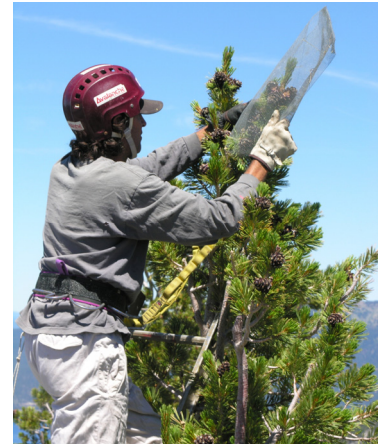
Fig. 1: Caging developing cones of a whitebark pine so that seeds can be collected later for seedbanking and trait analysis.